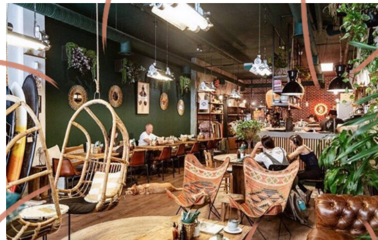
Olive green paint

This article contains sponsored product placements