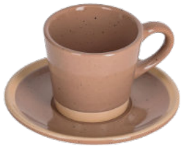
Tilla coffee cup Kave Home 3€