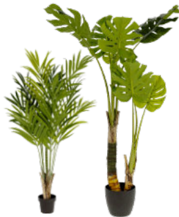
Monstera plant Kave Home 61€