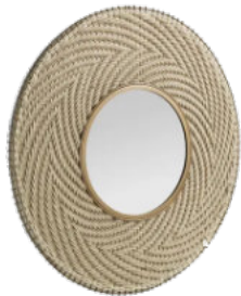
Klevin mirror Ø 80 cm Kave Home 132€