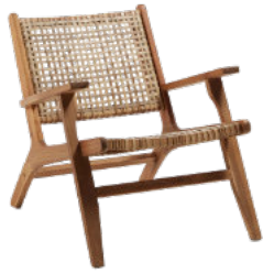
Grignoon Armchair Kave Home 235€