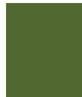
Banacha No. 298 (paint) Farrow & Ball