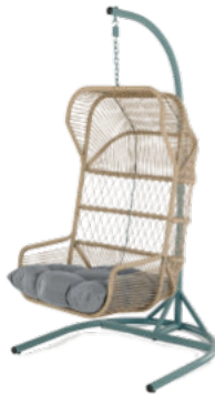
Lyra Hanging Chair Made.com £449