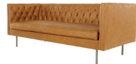
Studded Leather Couch