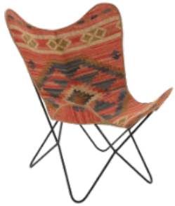
Aztec Butterfly Chair Deconti £254.99