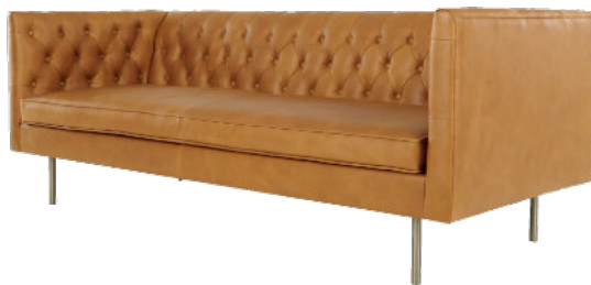
Julianne 3 Seater Sofa, Tan Leather Made.com £1499